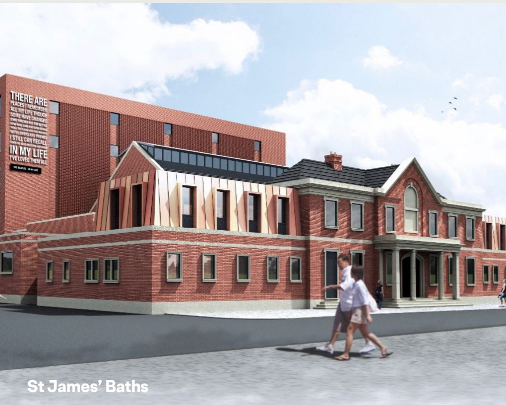
St James' Baths